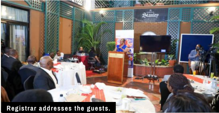
Registrar addresses the guests.