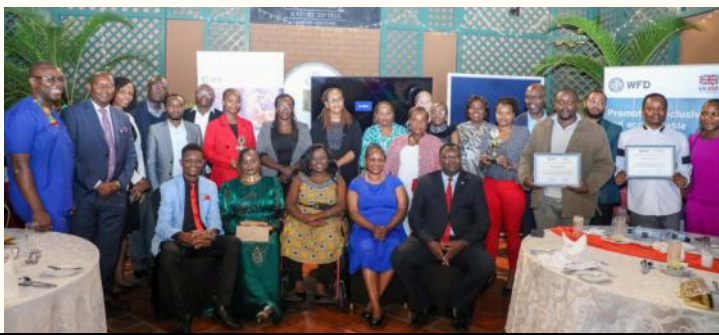
Registrar with Party representatives and WFD officials at Sarova Stanley