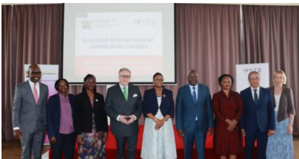
Registrar with the chief guest Chief Justice Hon. Martha Koome and guests after the official opening of the T-GBV workshop