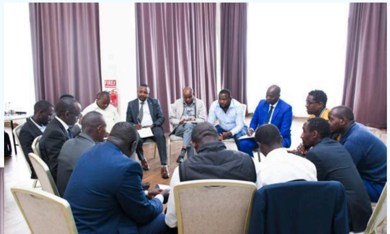
Part of men in a group discussion during the meeting christened “Men Conference”