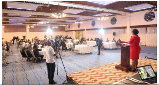
Registrar addresses the guests in the event held at Moven pick Hotel Westlands, Nairobi.