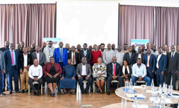
Registrar , HRM team and `men folk` in a men pose during the engagement

He informed in his retirement, he was now engaged in farming and also holds a number of chairmanship responsibilities in church, school and community associations within his locale. Further, men in groups, held discussions on socio-economic challenges encountered in personal and work spheres and shared appropriate strategies. The event was critical in unpacking and dissecting men matters in male perspectives. They also noted the need to support women colleagues and family members for a balanced living.